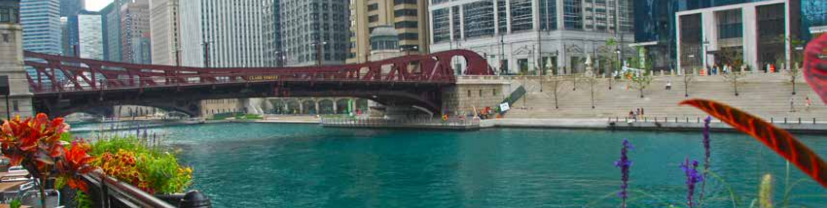
The Chicago Riverwalk, affectionately known as the "second lakefront", follows the south shore from the lakefront to the confluence of the Main, North and South branches of the river.